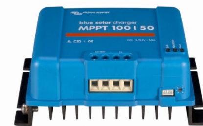
Solar Charge Controller MPPT 100/50